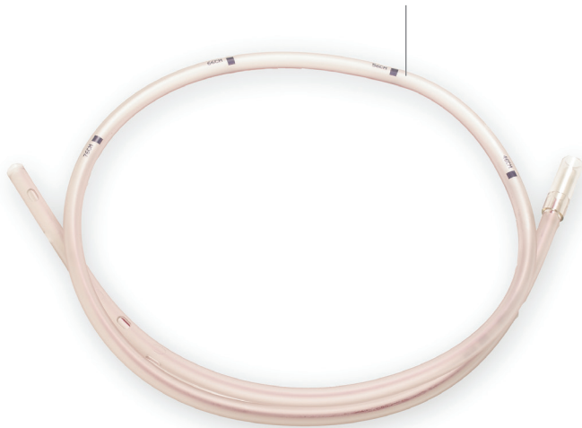
Reference marks at 18", 20" and 22" from distal end